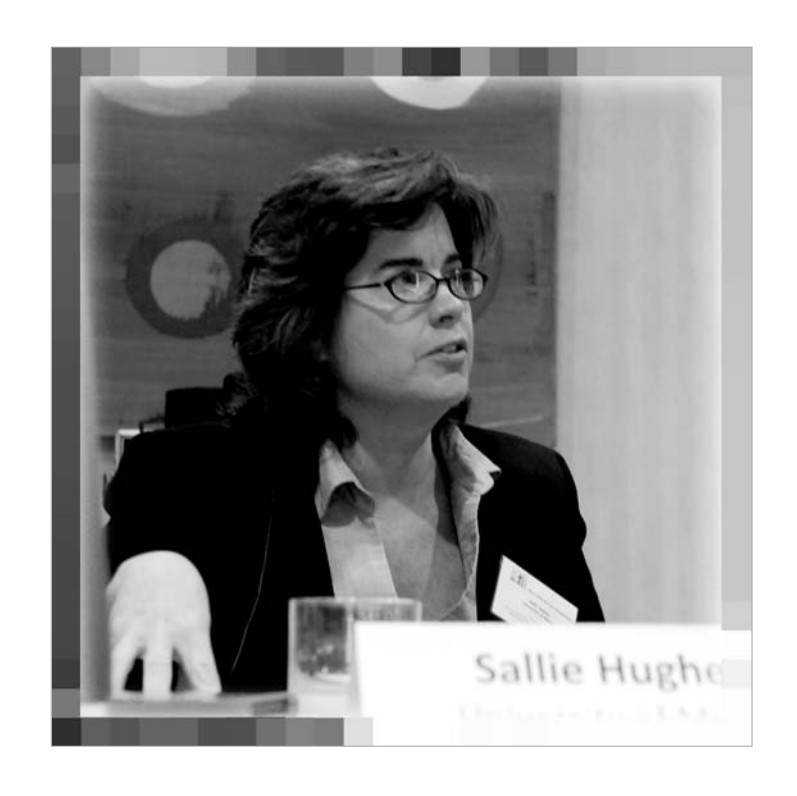
THE CONVERSATION THE INFLUENCE OF ETHNIC MEDIA ON POLITICS AND PARTICIPATION