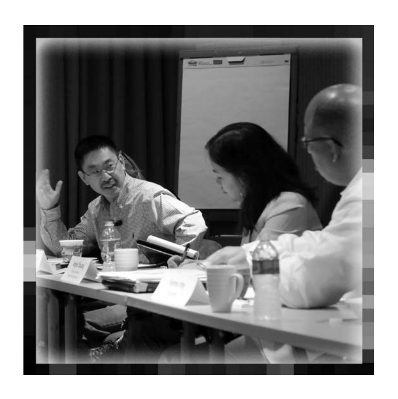
THE 2010 DISCUSSION IMPORTANT THEMES